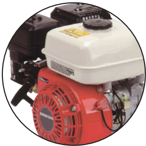
Honda GX120 Engine

A world leading Interpump direct drive pump powered by an ultra reliable Honda petrol engine ensures the Cobra has a long & trouble free life.