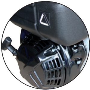
Lombardini 15LD350 Engine

A world leading Interpump direct drive pump powered by a robust Lombardini diesel engine ensures the Cobra has a long & trouble free life.