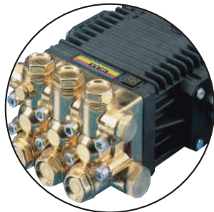
Interpump 44 Series