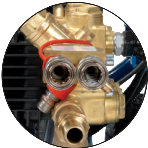
Twin Outlet fitted as standard

A key feature of the Thor is the unique Vibroflex torsional drive coupling. Located in-between the engine and gearbox it eliminates the on-off stresses and snatch effect that can occur when a conventional hollow to solid shaft drive system is used.