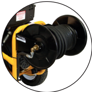
Optional 40m Hose Reel Available

A key feature of the Zeta diesel is the unique Vibroflex torsional drive coupling. Located in-between the engine and gearbox it eliminates the on-off stresses and snatch effect that can occur when a conventional hollow to solid shaft drive system is used