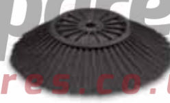
Side Brush 6.906-414