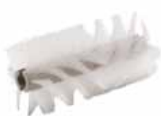
Main Roller Brush (hard) 6.906-723