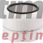
Round Filter 6.414-554

Septimus Spares www.septimus-spare.co.uk