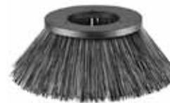
Side Brush (hard) 6.906-721