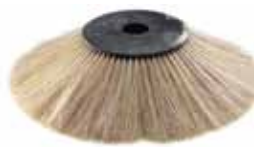
Side Brush (soft) 6.906-720