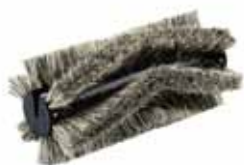
Main Roller Brush (soft) 6.906-722